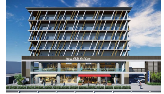
In-house designed building

Beyond BIM, the company utilizes drones, 3D mapping and scanning technologies. The president states that these tools are essential for large-scale projects and benefit not only the company but also local governments and communities.