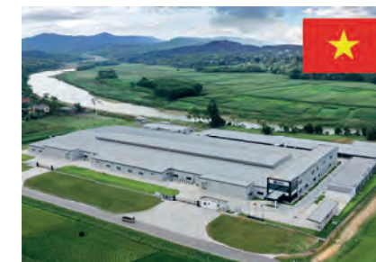
The business has many clients in Vietnam.