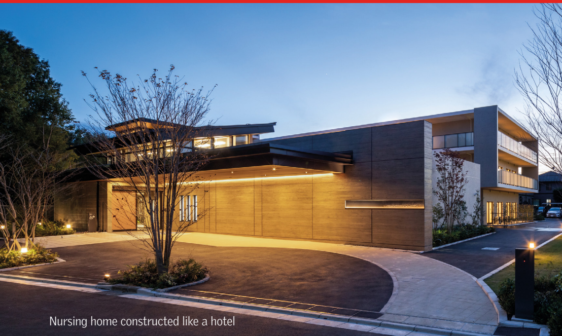
Nursing home constructed like a hotel