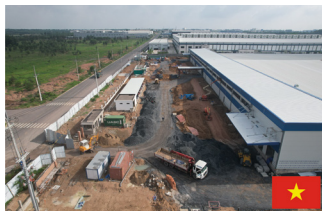
Factory construction in Vietnam

Based in Tokorozawa City, Saitama Prefecture, Hiraiwa is a leading construction and civil engineering company that's playing a major role in bringing Japan's aging buildings and infrastructure up to date. Established in 1953, the firm is also helping to maximize the island nation's resistance to natural disasters.