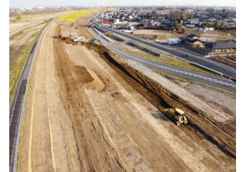
Levee protection works