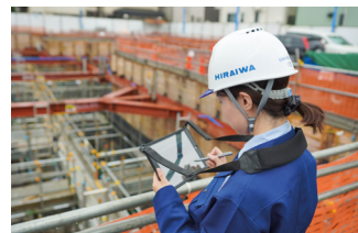
Women play an active role at construction site

"When an entire area is rebuilt from scratch, you also need to consider the infrastructure that goes with it – whether that's commercial facilities, hospitals, landlines, offices, and schools. This is why we believe that the situation is in a good spot right now for businesses like ours."